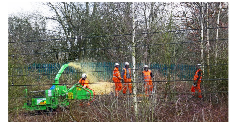
De-vegging in progress March 2018

Several White Polar trees to be coppiced and several White Poplars to be pollarded.