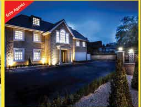
HADLEY WOOD £5,995,000

Freehold EPC - D Council Tax - H Local Authority - Enfield