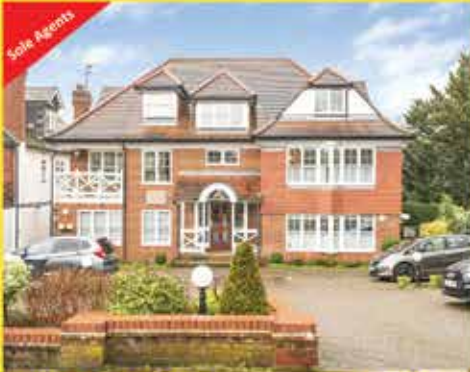
HADLEY WOOD £1,150,000