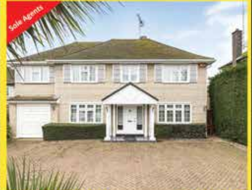
HADLEY WOOD £1,795,000

Freehold EPC - C Council Tax - G Local Authority - Enfield