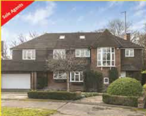
HADLEY WOOD £2,495,000

Freehold EPC - C Council Tax - H Local Authority - Enfield