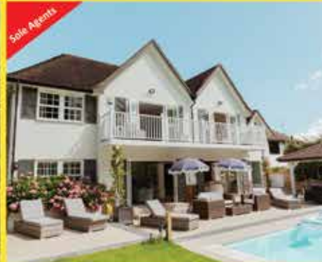
HADLEY WOOD £3,695,000

Freehold EPC - E Council Tax - H Local Authority - Enfield