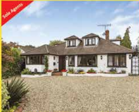
HADLEY WOOD £1,750,000

Leasehold EPC - C Council Tax - F Local Authority - Enfield