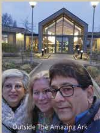
Outside The Amazing Ark