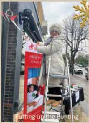
Putting up the Bunting