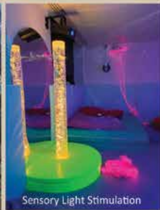
Sensory Light Stimulation