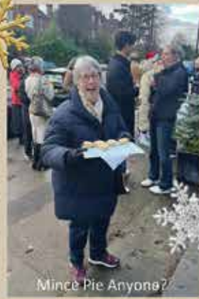
Mince Pie Anyone?