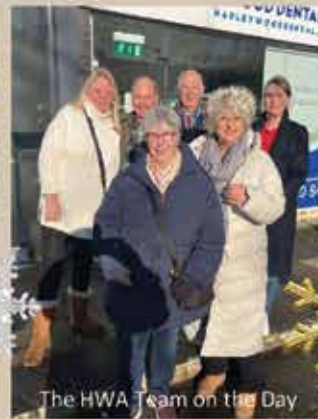
The HWA Team on the Day