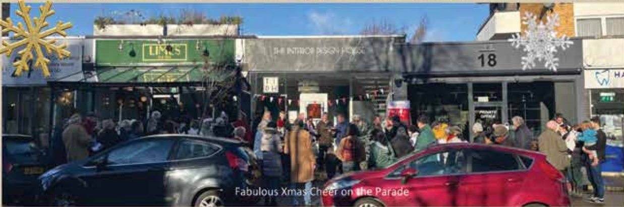
Fabulous Xmas Cheer on the Parade