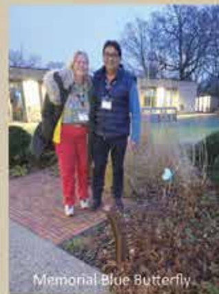
Memorial Blue Butterfly